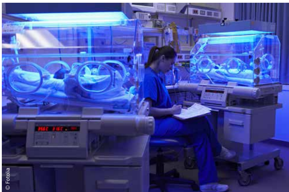
European households, public services and businesses need safe and reliable energy.

However, it still takes too long to obtain the permits needed for grid projects. The European Union therefore encourages the development and modernisation of energy grids in order to speed up the construction of any 'missing links', especially in eastern Europe. The role of the European Union should not just be one of overall coordination; in some cases it can financially support certain projects which are essential but involve too many economic risks for businesses and countries alone.