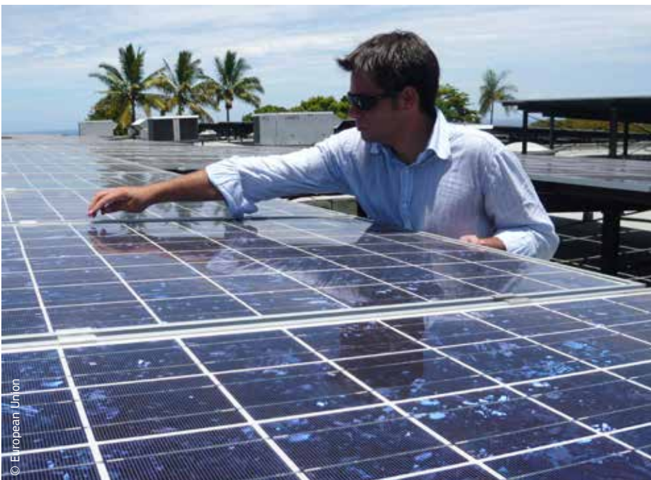
The EU takes part in many international programmes where it can spread its expertise in renewables.

The European Union has set up a permanent dialogue on energy issues with its main suppliers — Norway, Russia, the Gulf states and OPEC — and with other countries or regions playing an important role on the world energy stage, namely Brazil, China, India, the United States, Africa and the Mediterranean. The EU has launched many cooperation and aid programmes in the energy field throughout the world. It cooperates actively with organisations such as the International Energy Agency, the International Atomic Energy Agency and the International Energy Forum. It has signed up to the 'Sustainable energy for all' initiative launched in 2011 by the UN to help a further 500 million people in developing countries gain access to sustainable energy by 2030. Closer to its borders, the EU has signed the Energy Community Treaty in order to integrate progressively the energy markets of south-east Europe, Moldova and Ukraine on the basis of the EU energy, competition and environmental rules. Energy is also a key element of EU neighbourhood policy with countries in the south and east of Europe, with specific emphasis on energy efficiency and the promotion of renewable energy sources.