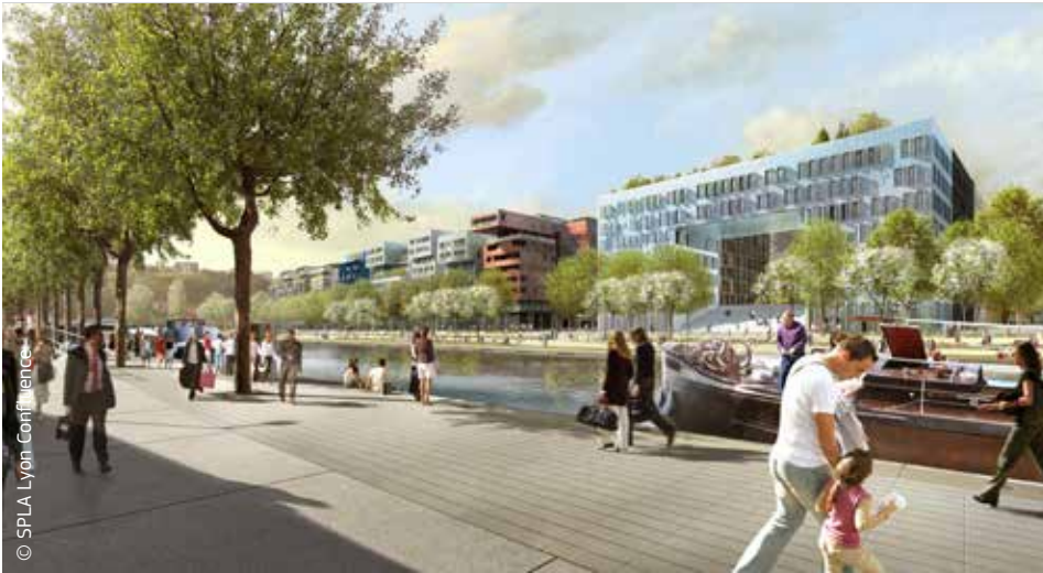
Cities of the future will be low carbon and provide better services for their increasing populations.