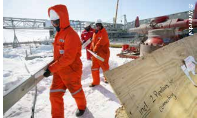
Generating energy and transporting it to consumers requires huge technical, logistical and financial resources.

Lighting, heating, transport, industrial output: energy is vital for essential day-to-day services, without which we and our businesses cannot function. Europe's stocks of fossil fuels (oil, gas and coal) will not, however, last forever. They need to be judiciously managed while we look into new sources of energy. Europe is consuming, and importing, increasing quantities of energy. EU countries are well aware of the advantages of coordinated action in this highly strategic field. This has led to common rules throughout Europe and a pooling of Europe's efforts to secure the energy that it needs at an affordable price, while generating the least possible pollution.