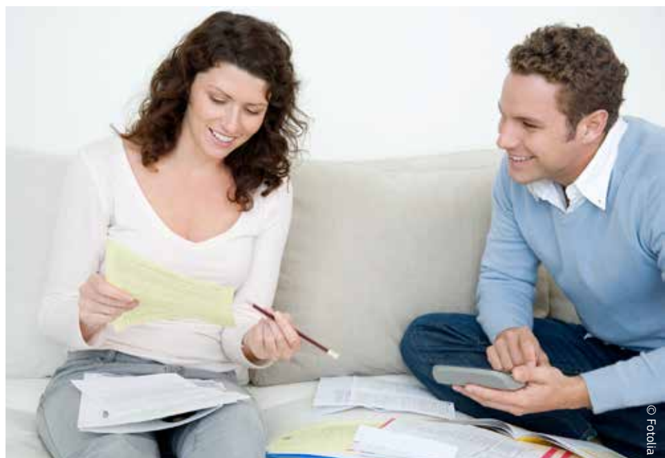
The challenge for Europe: lowering consumption while preserving living standards.

All EU countries have had to set indicative national energy efficiency targets for 2020 and draw up plans outlining how they intend to reach them. Given the challenging economic climate, the EU has to pull out all the stops if it is to spur investment and concrete actions in the field of energy efficiency. Even if investments in energy efficiency quickly become profitable and act as leverage for further investment, the money has to be made available in the first place. The European Union can help its members to finance their energy efficiency